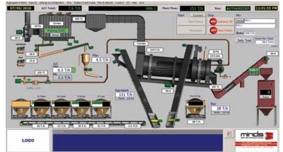
The DrumTronic system allows plant operators the option of one to four screens that display bar graphs, plant configurations, charts, and more to give a quick and easy snapshot of the plant's status.

"This was one of the first controls in 1999 to use Windows operating system instead of DOS oper-